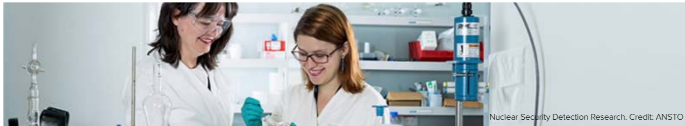
Nuclear Security Detection Research.

Please visit our website to download the PDRA Application Form and Guidance Notes.