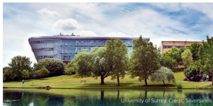
University of Surrey.

topics include, Detection systems, Muon detection for core monitoring (including WATCHMAN), Algorithms and Autonomous Decision Making and UAV Monitoring and Environmental Measurements.