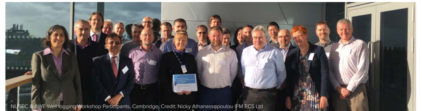
NUSEC & AWE Well logging Workshop Participants, Cambridge.

Good scientific outcomes delivered by our workshops and Summer Pilot Projects, some of which are being taken forward by our network partners.