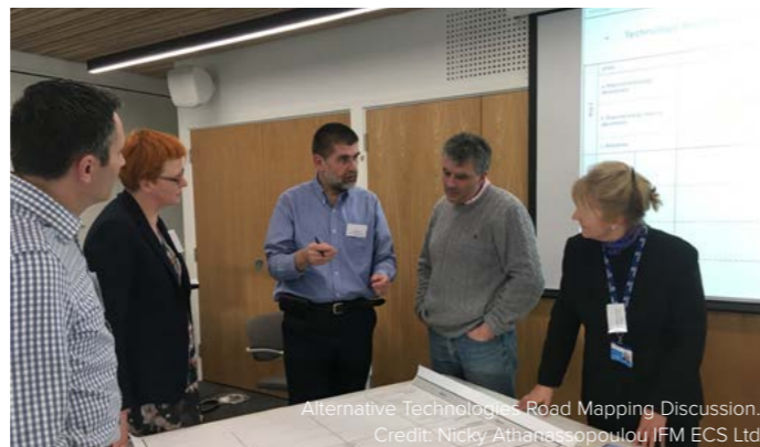
Alternative Technologies Road Mapping Discussion.

The following actions were considered important for reducing and eventually eliminating the use of radiological or nuclear material by the energy industry.